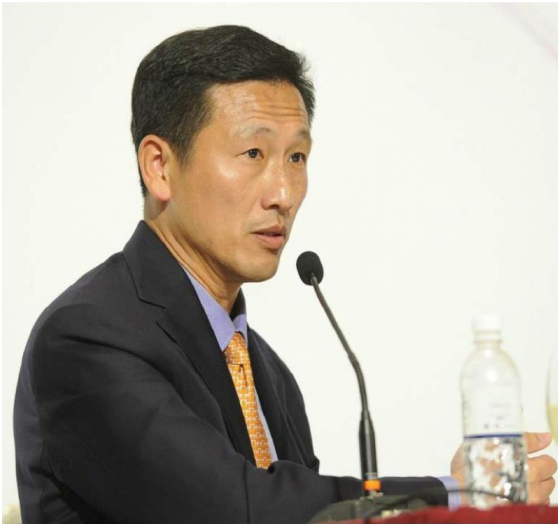
Mr Ong Ye Kung

We should not be pushing the young to rush into declaring their interests prematurely. I will be rather upset if I change this policy and see the sprouting of a new tuition industry coaching students how to ace interviews. If a young person has yet to discover his area of interest, the system should give him more time for self-discovery. And if he for some reason cannot get into the course of study he wants, then I hope he can give what he has a chance. We should make the best of the hand we are dealt with in life.